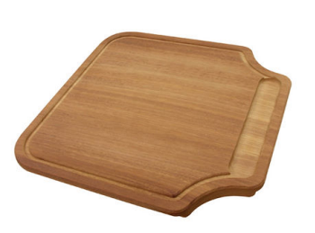
Iroko-wood chopping board 8646 000

8159 101 * only in combination with the accessory 8644 101